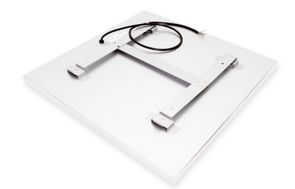
MAGNUM Sol Type 300